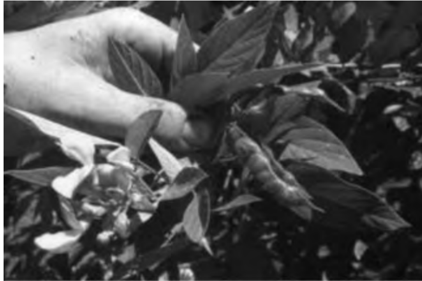
Magnification \times 1

The pigeon pea plant ( Cajanus cajan ), shown in the photograph below, produces an inhibitor of alpha-amylase. This inhibitor reduces the activity of alpha-amylase.