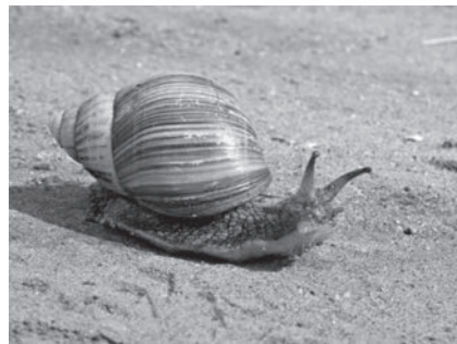
Giant African Land snail, Magnification x0.5

2 A student decided to investigate habituation in Giant African Land snails ( Achatina fulica ).