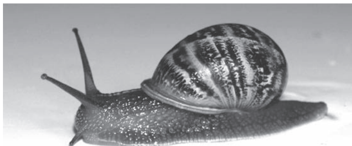
A Snail – Magnification \times 2

After repeated exposure to the same stimulus, the snail will stop responding to the stimulus. This behaviour is called habituation.