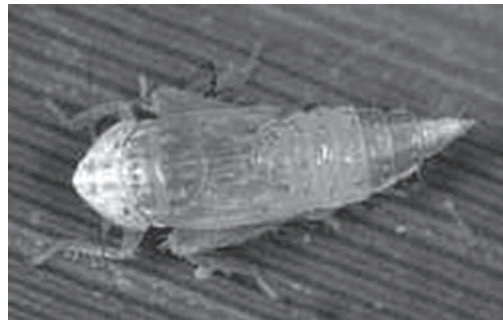
Magnification \times 10

Plan an investigation to determine the effectiveness of wolf spiders, bred in the laboratory, in the control of leafhopper nymphs in rice fields.